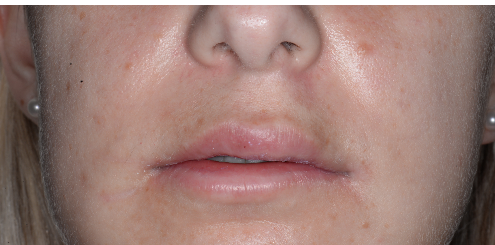
Figure 3 Day 8 Post-op