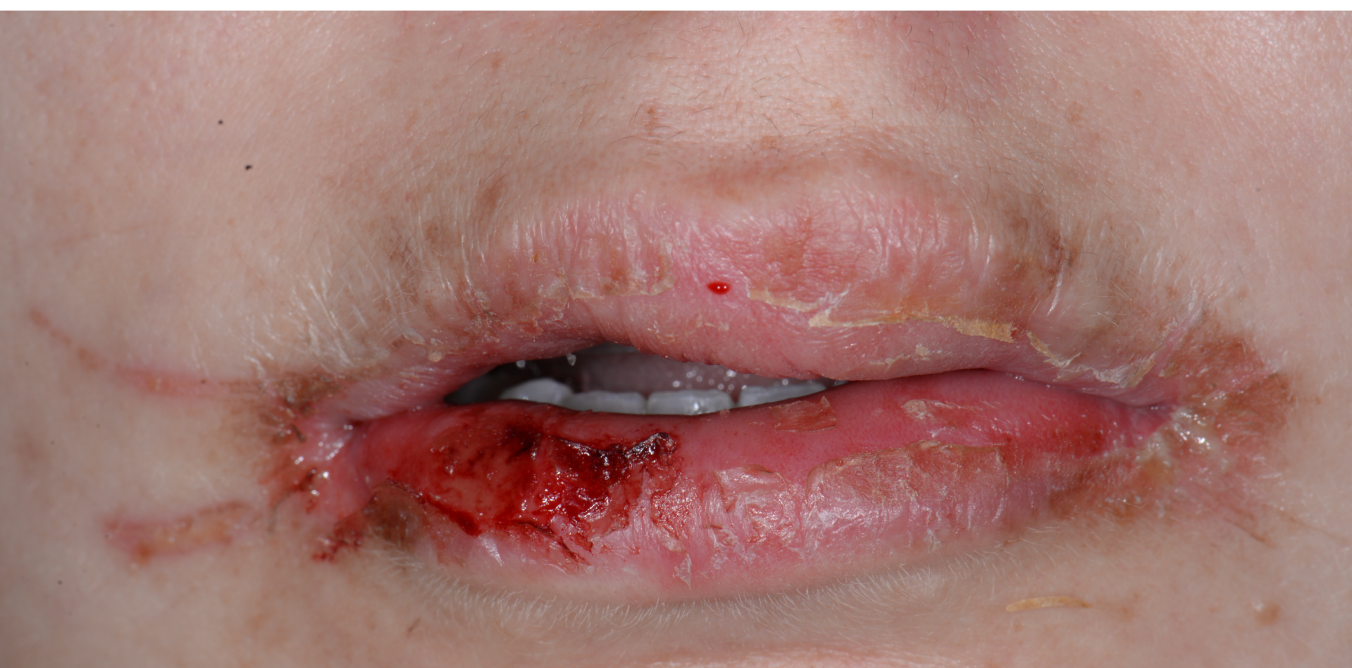
Figure 1 Day 2 Post-op