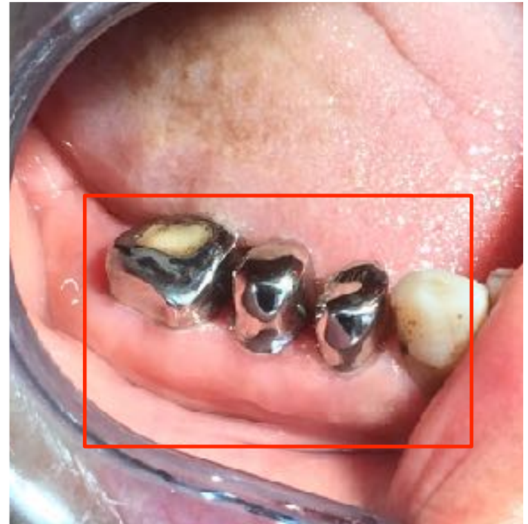
After using blue ® m