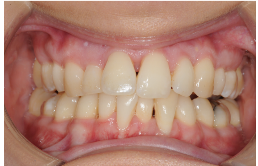
After initial therapy