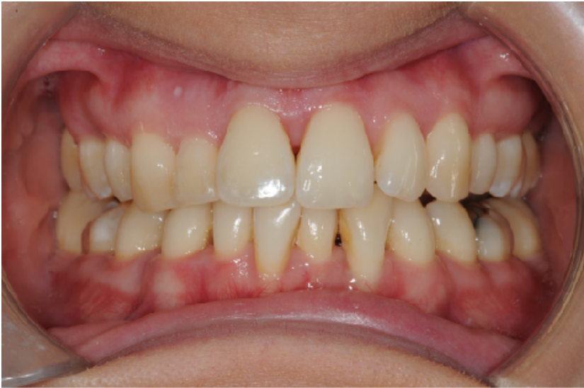
Before initial therapy

Periodontal evaluation after rootplaning, laser treatment and 6 weeks blue ® m oral gel