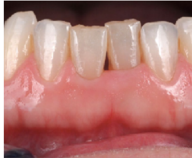
After 6 weeks