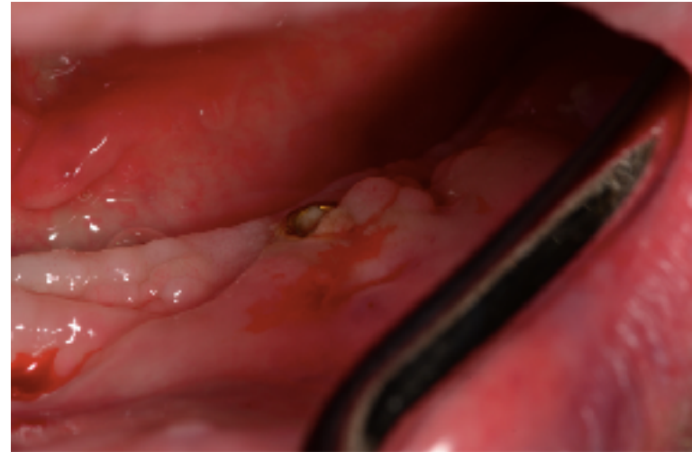
1 month post-operative